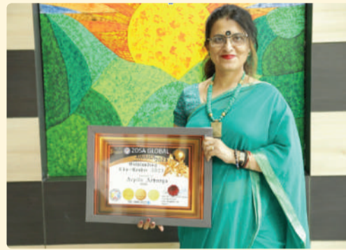
2DSA Global Award 2023

as well as awarded with 2DSA Global Award 2023. These prestigious awards recognized her exceptional efforts in creating a positive learning environment, fostering innovation, and nurturing the overall development of our students. Through her visionary approach, innovative initiatives, and compassionate leadership, she continues to inspire generations of students and educators, leaving an indelible mark on the educational landscape.