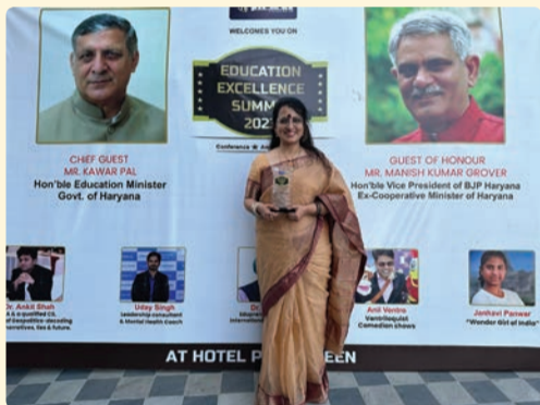
Outstanding Educational Leader Award 2023